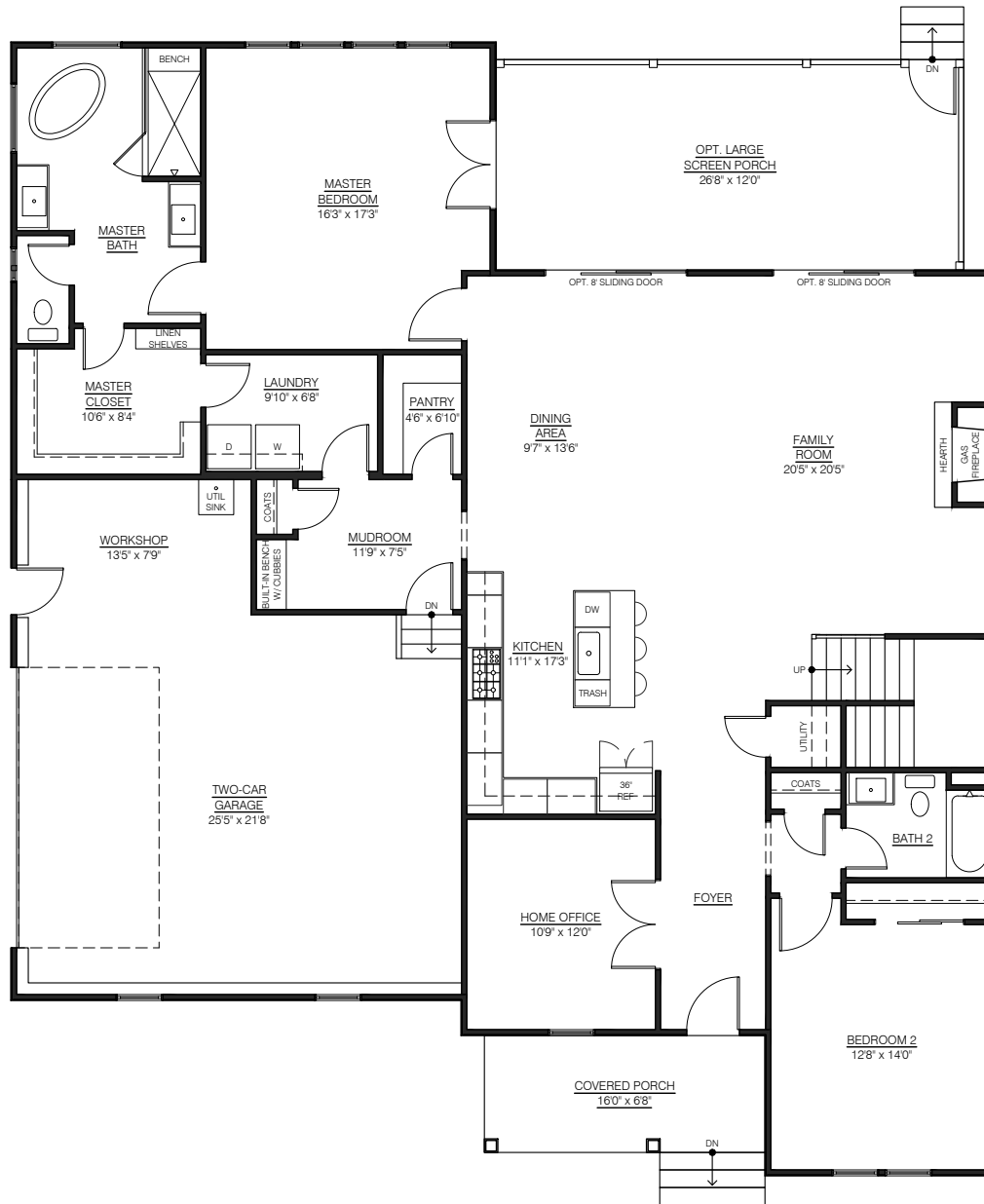
THE PALMER GROUND FLOOR PLAN - 2,205 SF